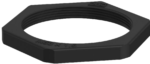
Locknut DIN 46319, with metric thread IEC 423.