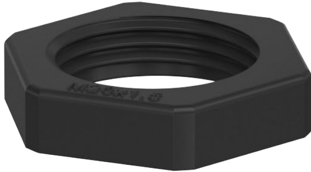
Locknut DIN 46319, with metric thread IEC 423.