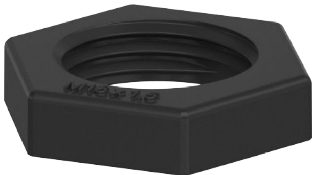
Locknut DIN 46319, with metric thread IEC 423.